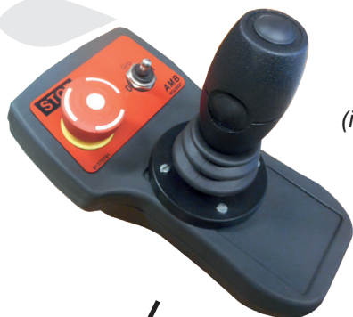
Orders electrical (in the tractor)