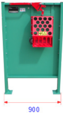
Standard 'spoon' square 10 mm